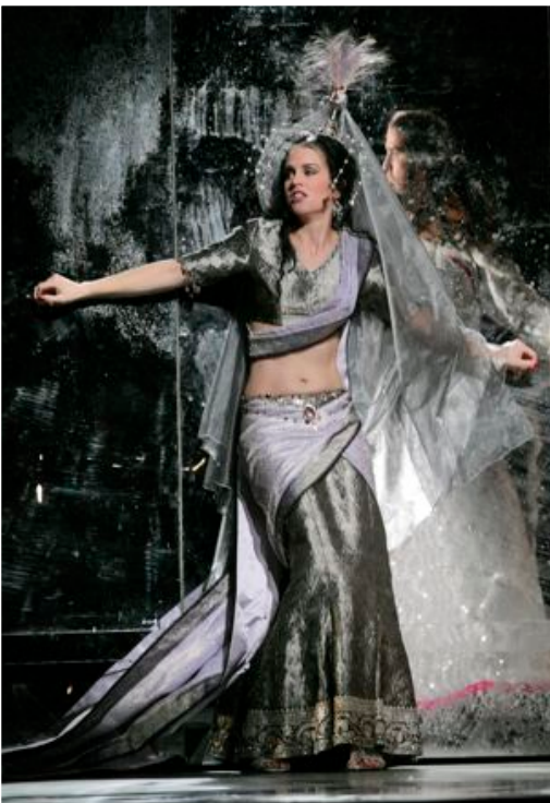
Zenobia Santa Fe Opera, Radamisto