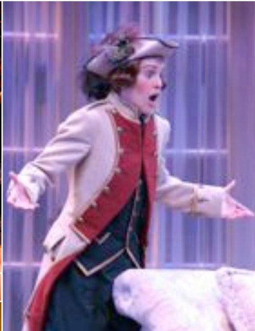
Cherubino, Music Academy of the West, Le Nozze di Figaro