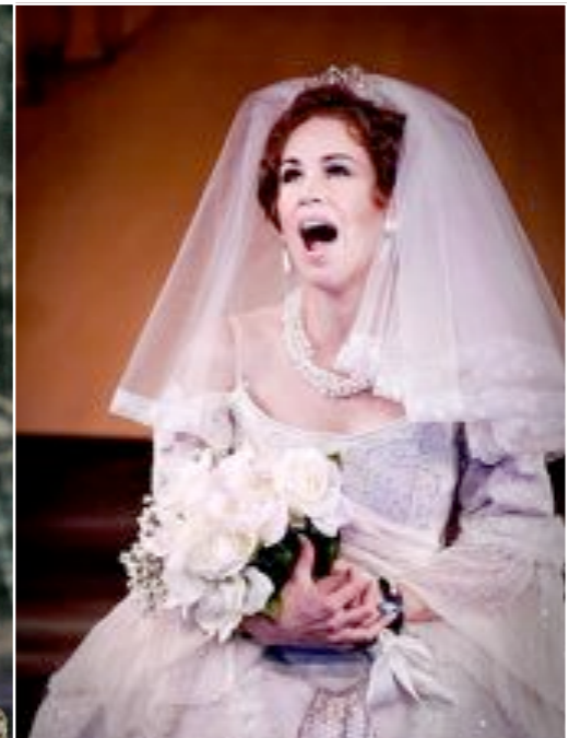
Angelina Opera Southwest, La Cenerentola