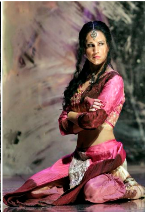
Zenobia Santa Fe Opera, Radamisto