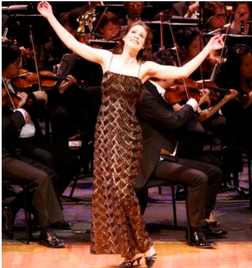
Hong Kong Philharmonic